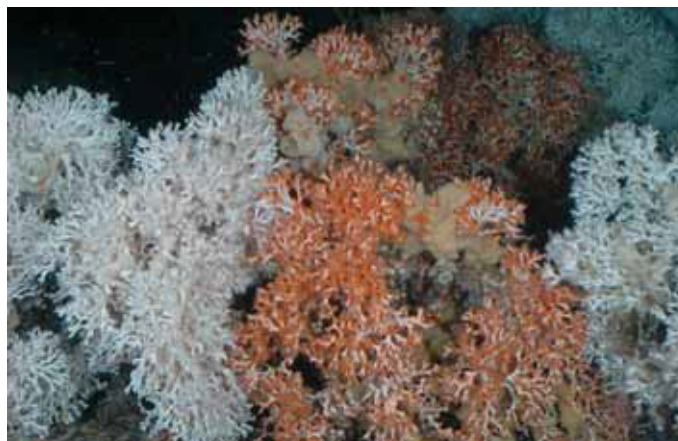
Figure above: Lophelia pertusa reef (showing the white and orange colour morphs) at 400 m depth off Rost, Norway, the largest cold-water coral reef on Earth. Photograph taken on Polarstern Cruise ARK-XXII © Jago/IFM Geomar 2007.