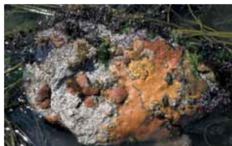
Diverse underboulder community including encrusting sponges and the bulbous bryozoan Turbicellepora magnicostata .