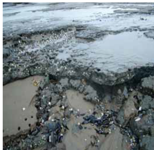
Figure.10 Piddocks in peat. (Image: JNCC shells. (Image: CCW).