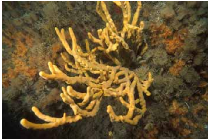
showing a large specimen of the sponge Axinella dissimilis .

Zone/depth Upper circalittoral and lower circalittoral