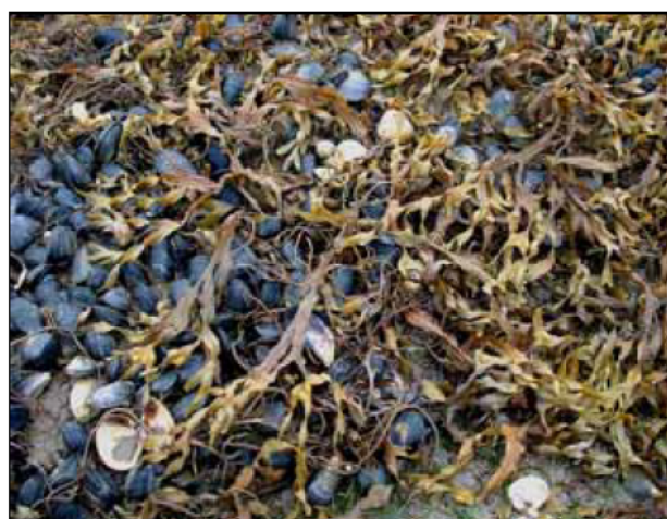
Blue mussel, Mytilus edulis on intertidal sediment (Photo: CCW).