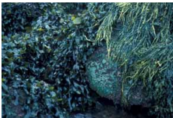
Figure 2. Fucus serratus and Ascophyllum nodosum on boulders.