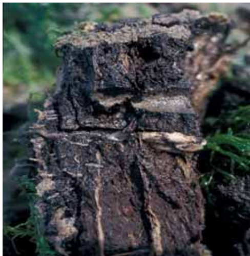
Figure 9. Clay exposure with dead piddock image collection, Anon.)